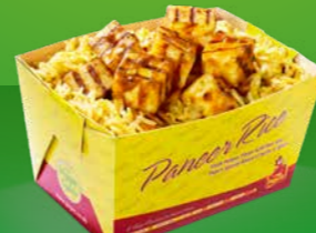
kcal 926 £6.79