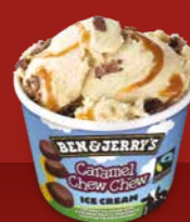
Caramel Chew Chew Ice Cream 231 kcal