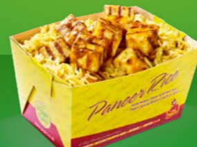
kcal 926 £6.79