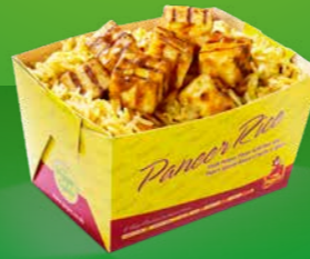
kcal 926 £6.79