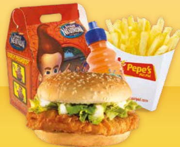
kcal 639 Chicken Steak Burger, Fries & Fruit Drink