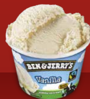
Vanilla Ice Cream 270 kcal