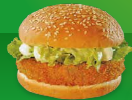
kcal 433 £3.49