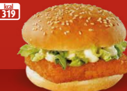
kcal 319 Fish Burger £2.79