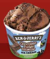
Chocolate Fudge Brownie Ice Cream 245 kcal