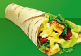
kcal 464 £5.29

ADD Fries, Drink & Dip* +£2.30 • GO LARGE Only +90p