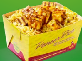
kcal 926 £6.79