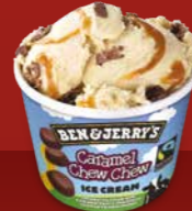
Caramel Chew Chew Ice Cream 231 kcal