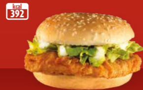
kcal 392 Chicken Steak Burger £2.79