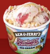
Strawberry Cheesecake Ice Cream 241 kcal