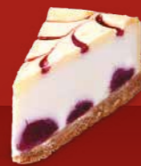
kcal 315 Strawberry Cheesecake