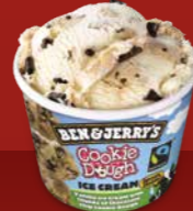
Cookie Dough Ice Cream 270 kcal