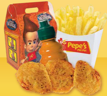
kcal 343 3 x Chicken Nuggets, Fries & Fruit Drink