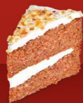
kcal 325 Carrot Cake