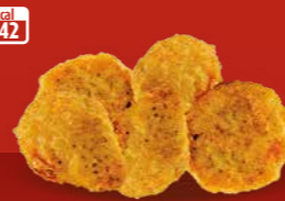
kcal 242 5 Chicken Nuggets £3.09