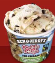
Cookie Dough Ice Cream 270 kcal