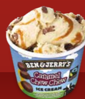
Caramel Chew Chew Ice Cream 231 kcal