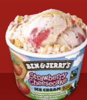
Strawberry Cheesecake Ice Cream 241 kcal