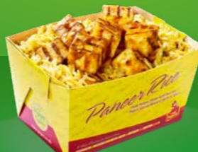
kcal 926 £6.79